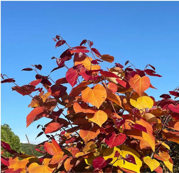
CERCIS CANADENSIS 'NC2016-2' PP# 31,260 FLAME THROWER®