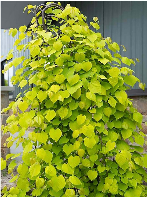
CERCIS CANADENSIS 'NC2015-12' PP# 31,658 GOLDEN FALLS®

“Because of your regret and pity for My suffering, never again shall the dogwood tree grow large enough to be used as a cross. Henceforth it shall be slender and bent and twisted and its blossoms shall be in the form of a cross . . . two long and two short petals. And in the center of the outer edge of each petal there will be nail prints, brown with rust and stained with red, and in the center of the flower will be a crown of thorns, and all who see it will remember . . . that it was upon a dogwood tree I was crucified and this tree shall not be mutilated or destroyed, but cherished as a reminder of My death upon the cross.”